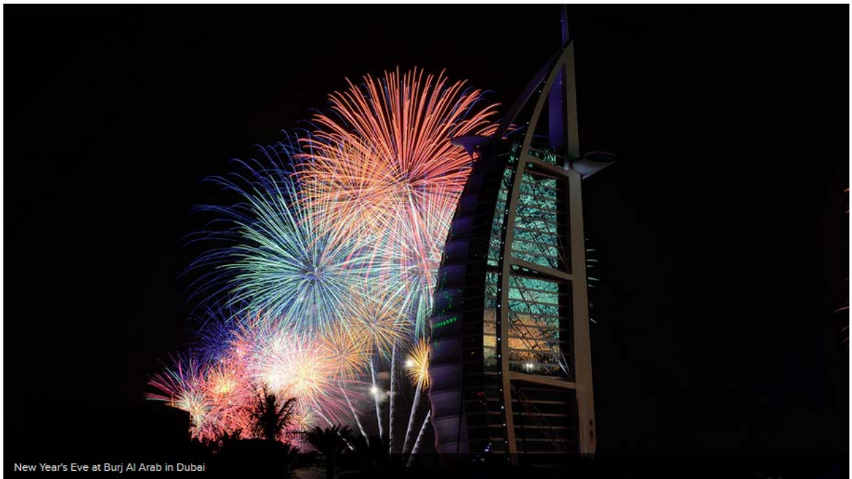
New Year's Eve at Burj Al Arab in Dubai